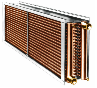
Type C, CB & CP (Helical Fins)