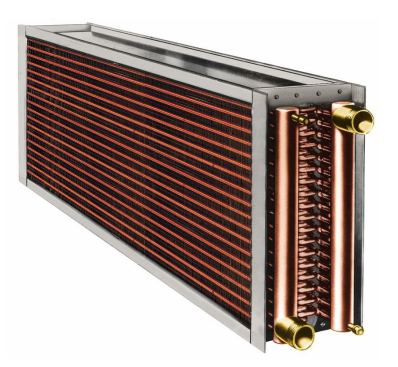
Type W (Plate Fins)