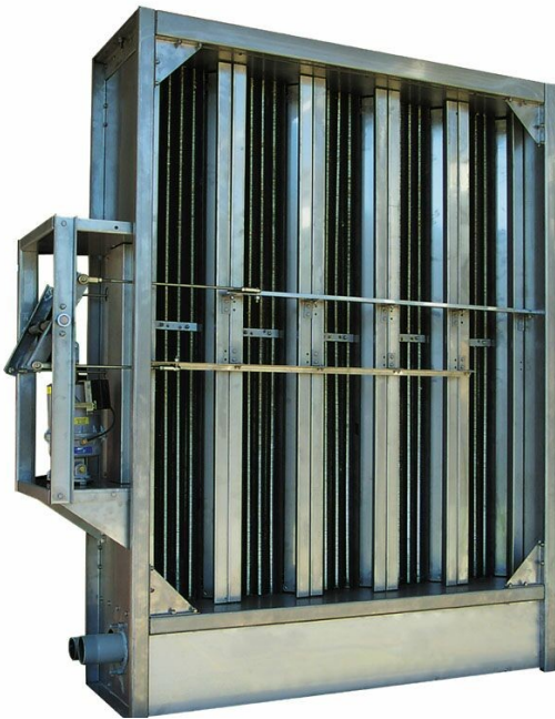
Vertical Tube VMW, VMX, AMW, AMX Plate Fin or Spiral Fin

HORIZONTAL AND VERTICAL TUBE AEROMIX® HOT WATER / STEAM INTEGRAL FACE & BYPASS COILS