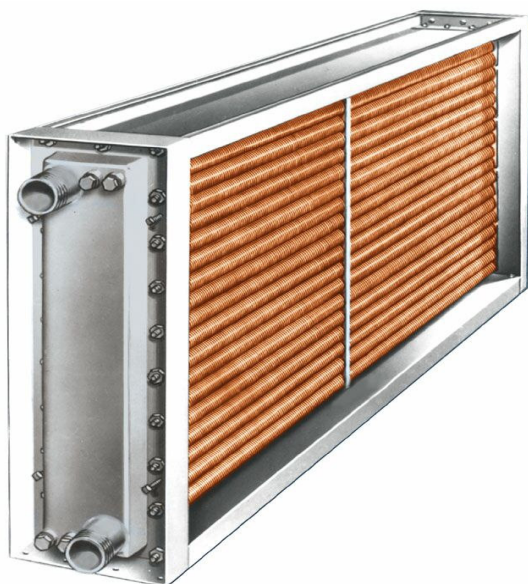
Type R, RC, RP & RCP (Helical Fins)