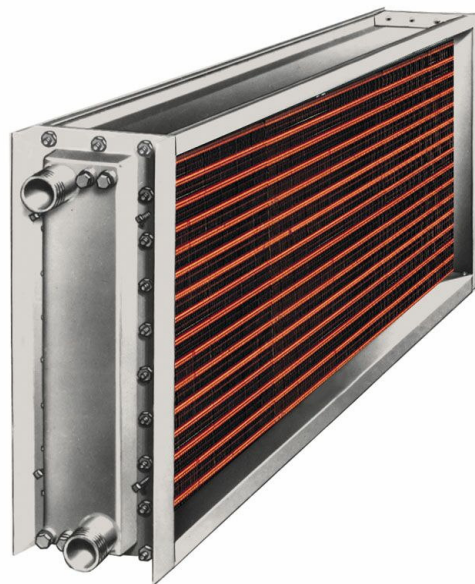
Type WR & WRC (Plate Fins)